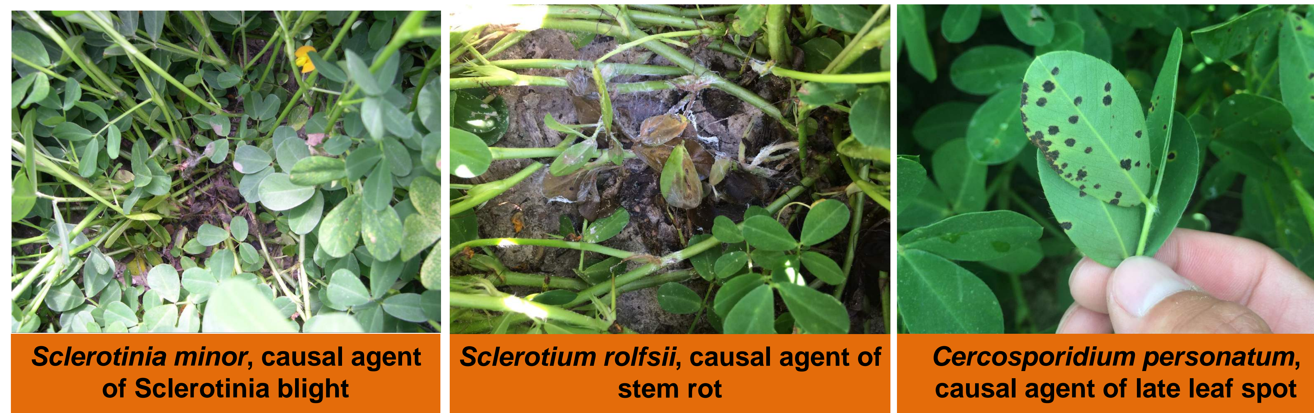
Figure 2. Peanut diseases observed in 2017.